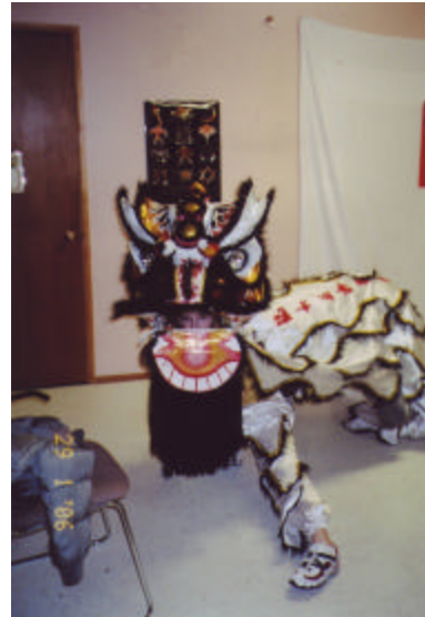
A visit from a Lion Dancer

speakers representing Islam, Judaism, Taoism, the Quakers, Wicca, neo-paganism, one Native American tradition, and Buddhism this year! The Middle School group visited the local mosque, the nearby Episcopal church and went on an overnight trip to Portland to visit a Hindu temple, a Buddhist community, the Bahai's, First Unitarian, and the big, beautiful synagogue.