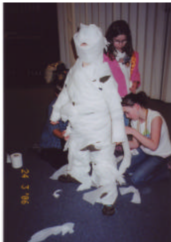
Playing “Mummy Tag” at the Chalichelighter 4-5th grade party!

At the beginning of the year, we held age group potlucks for Infant—Kindergarten kids and Middle/High School, which were well attended. We offered 2 All RE potlucks which had low attendance. We will be moving towards a pizza party type gatherings next year. The 4-5 grade pizza and game night was well attended and lots of fun!