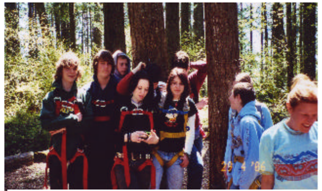
Coming of Age youth and other UU youth participate in the Spencer Butte Ropes Course.

There have been a lot of changes and growth this year. Knowing where we are at in our growth as a congregation, this feels like a natural progression!