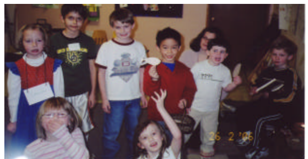
The K-1st grade Earthkeepers pose after their "Loaves and the Fishes" play.